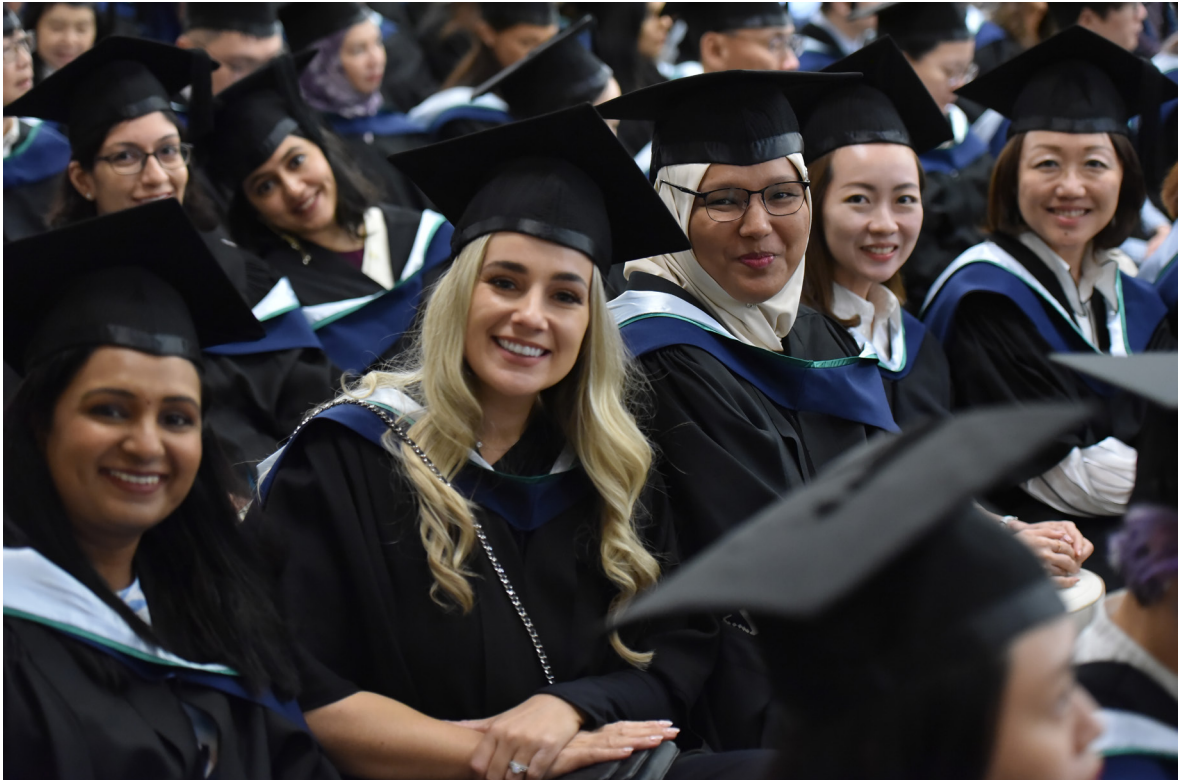
ECTA Graduation Ceremony 2024 (First Graduating Class of 2024)

Words and Music by James Horner and Will Jennings From the 1991 animated film, "The Land Before Time" Recorded by Diana Ross