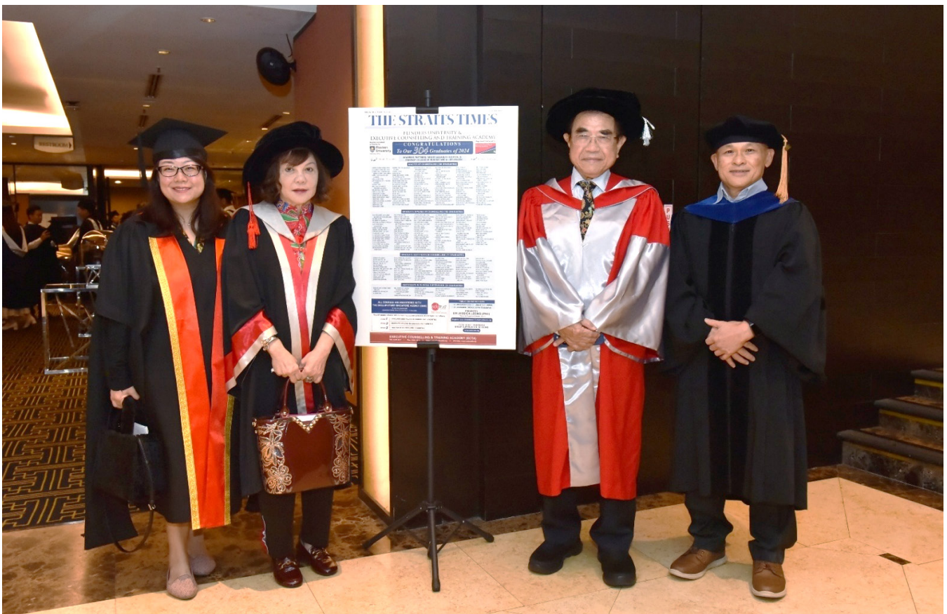
ECTA Board of Directors