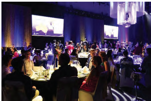
Flinders NT Medical Program 10 Year Anniversary Gala

These opportunities are promoted in our monthly alumni e-newsletter – keep an eye out for it in your inbox. And don't forget to update us if you move or change email address, that way we can let you know about events and opportunities in your location.