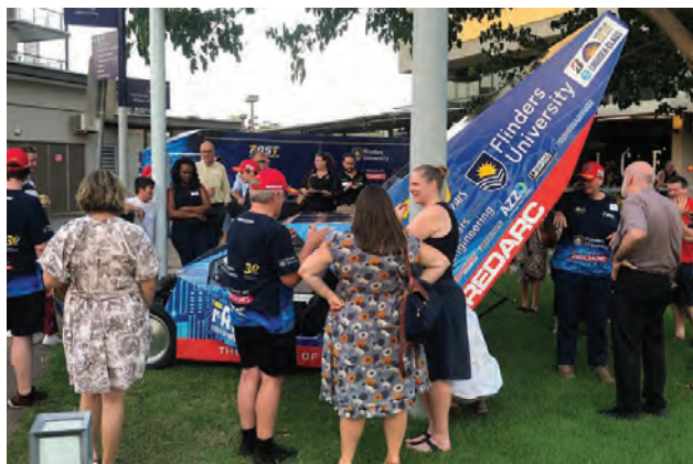
Darwin Alumni Cocktail Evening and Flinders Automotive Solar Team (FAST) meet and greet