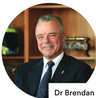
Dr Brendan Nelson AO