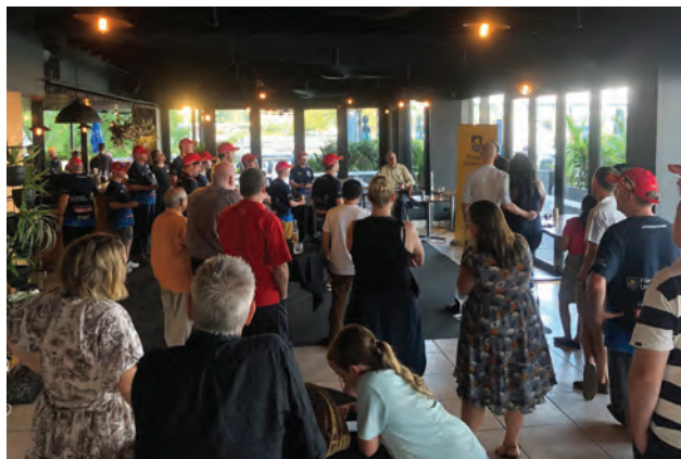
2023 NT Alumni Reception